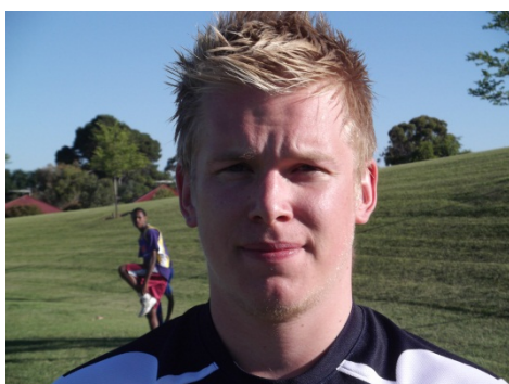
Carl Robinson VIP Electrical