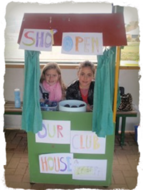
Entrepreneurs Lulu & Jacey waiting for their customers