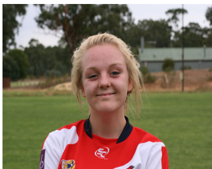
Danni Cross Spatio Architects