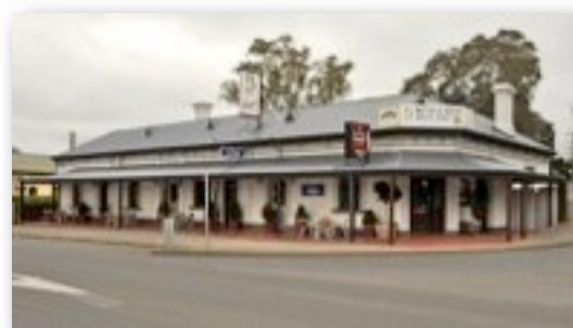
The Balhannah Hotel - the Hawks Club Pub.

Adelaide Hills v Enfield Hawks Nest 3.00pm KO